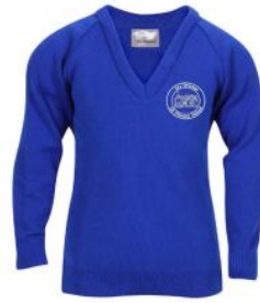
Dry Drayton Knitted V-Neck Jumper