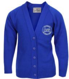
Dry Drayton Knitted Cardigan

https://price-buckland.co.uk/ dry-drayton-c-of-e-primary- school-knitted-v-neck-jumper-p